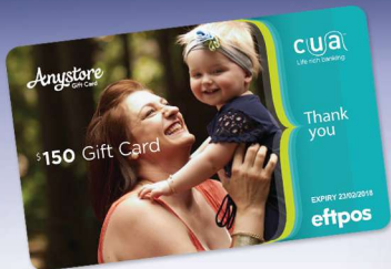
Personalised EFTPOS Gift Cards

Our cards can be personalised with an image and denomination to meet your requirements. Personalised cards deliver value along with your BRAND and message.