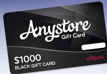
Generic EFTPOS & VISA Gift Cards

Customise an EFTPOS or VISA card with your company logo or brand.