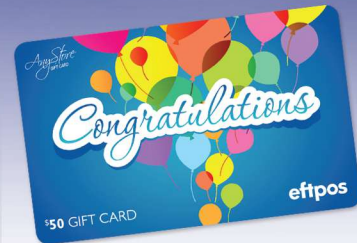
Generic Theme / Event Gift Cards

Need a gift card that gives the gift of choice but don't need it personalised – our generic cards come in a range of denominations from $25 to $1000.